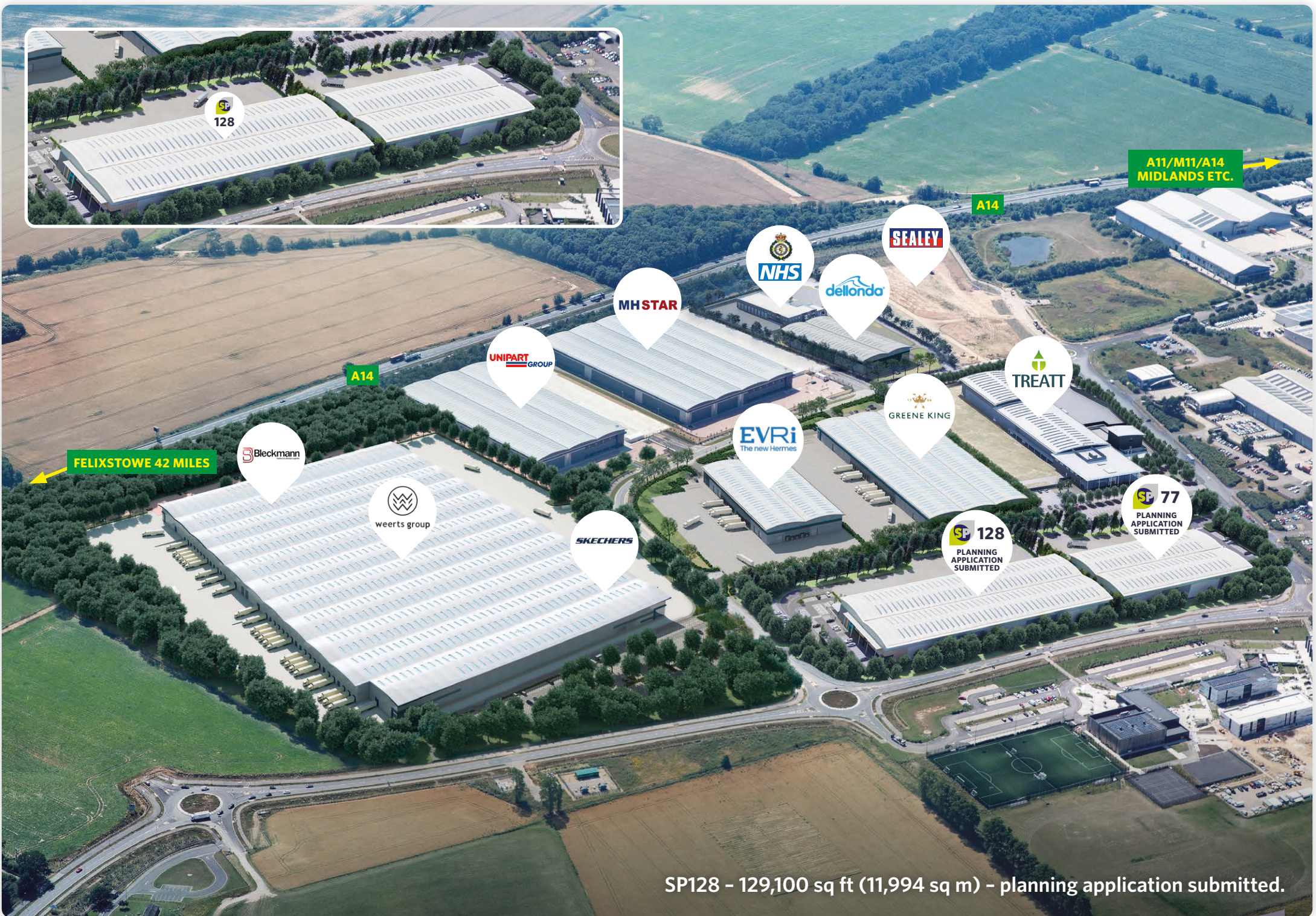
SP128 - 129,100 sq ft (11,994 sq m) - planning application submitted.